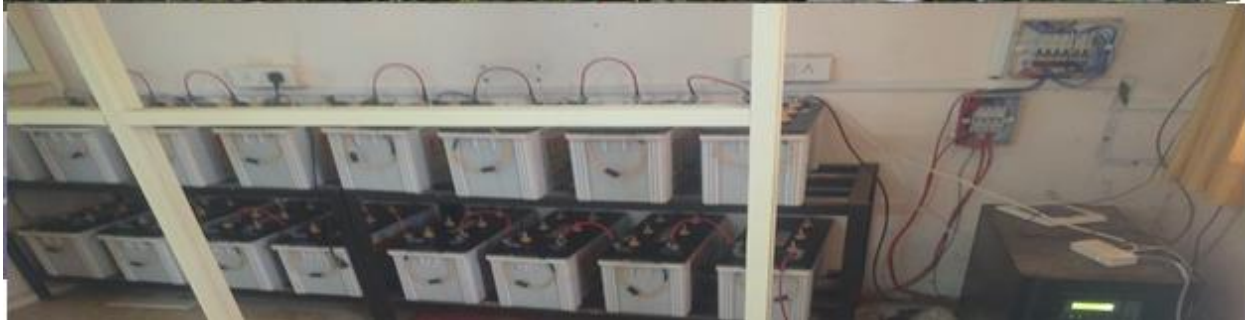
UPS POWER INVENTOR